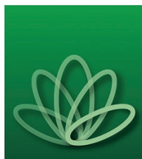
بنك القاهرة عمان CairoAmmanBank

The Cairo Amman Bank is a full-service bank in Jordan and Palestine, with head office in Amman. The head office for the Palestinian territories is in Ramallah. The bank operates about 84 branches and offices in Jordan and 21 in the Palestinian territories.